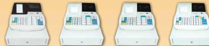
* Models shown on the above are all in small drawers *